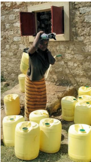
Fresh water for Timbwani

The fresh water behind the new house is still fresh, but hasn't yet been used as we're waiting to get electricity installed in the house; it can then be pumped out hygienically.