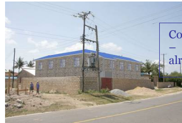
Computers! Amazing – it looks like it's already finished.